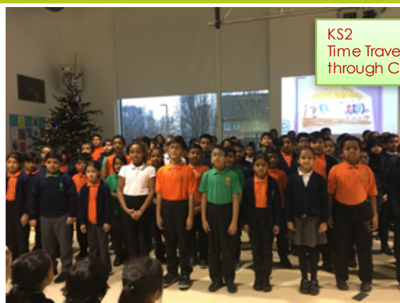
KS2 Time Travelling through Christmas