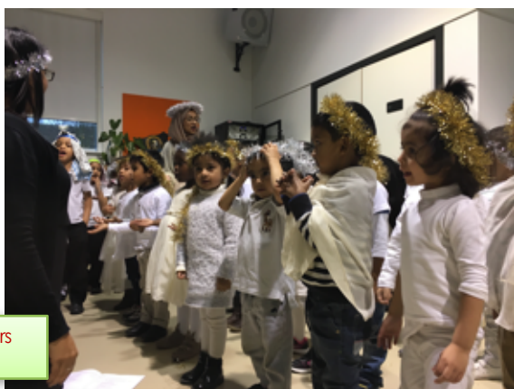
Early years Nativity

Do you keep a diary or a journal? Research shows that this can really help with learning. Why not try?