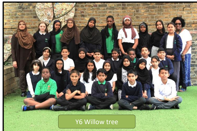
Y6 Willow tree