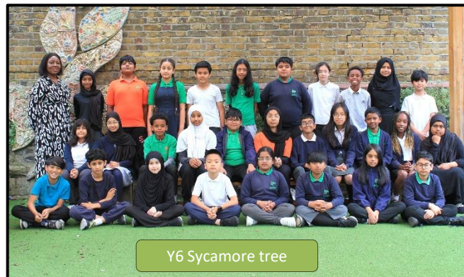
Y6 Sycamore tree