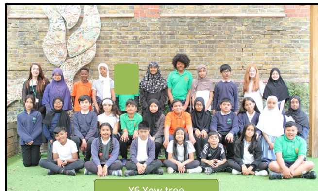
Y6 Yew tree

We wish our amazing Y6 pupils lots of luck in their secondary schools. You are all very special people, and we will miss you. Be proud of who you are; stand brave and stand tall. Thank you for everything that you and your families have contributed to Woolmore School.