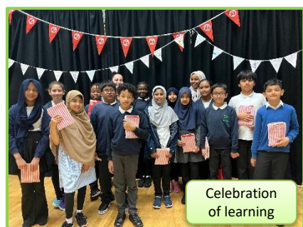
Celebration of learning