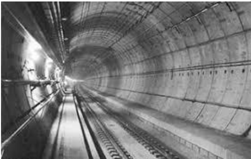
The Channel Tunnel is a tunnel under the sea that links England and France.

A tunnel is a long passage under the ground. Tunnels are usually built as a way of getting from one side of an obstacle to the other.