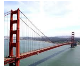
Metal suspension bridge

A bridge is a structure built over a road, river or railway that allows people or vehicles to cross from one side to the other. Bridges can be built from a range of materials.