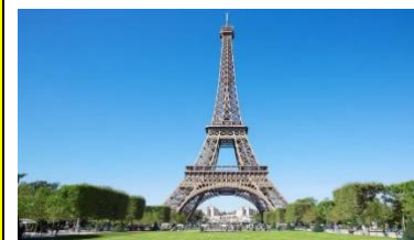
Eiffel Tower – Paris, France