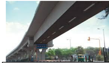
Concrete road bridge