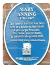
Plaque for Mary Anning