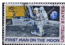
Stamp for Neil Armstrong