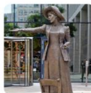
Statue of Emmeline Pankhurst

A memorial is made to remind people of a significant person or event. Memorials can include statues, monuments, plaques and stamps.