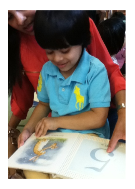
We really enjoy reading books at the Idea Store.