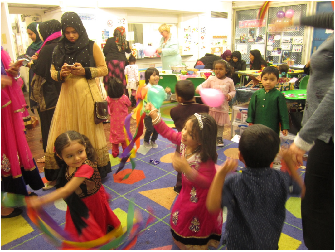
Look at us dancing with our ribbons!