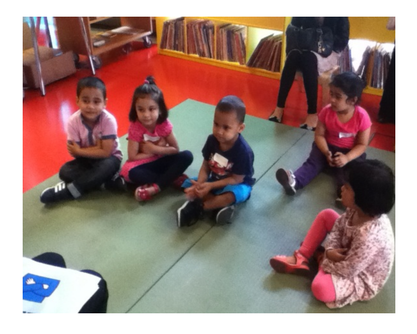
Nursery helping each other do good sitting!