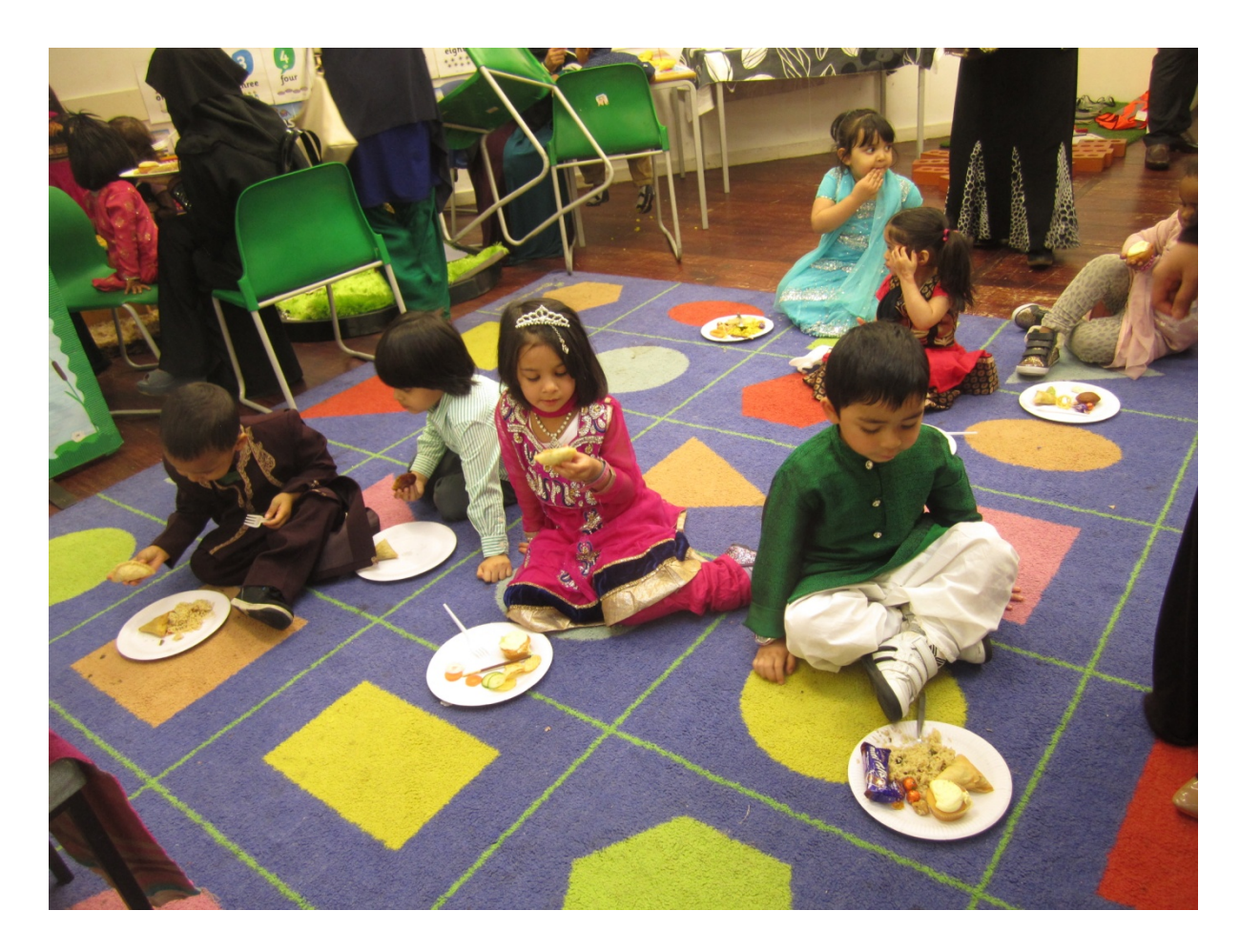
Look at all of the delicious food we had!

"The Eid party was very nice. All of the parents and children really enjoyed themselves." Avir's mum.