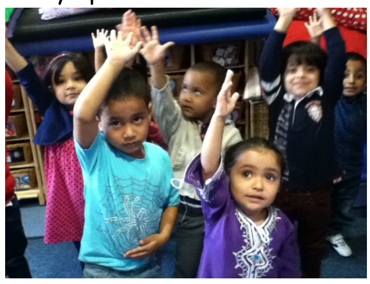
Nursery loved counting up to 10 like a rocket!

This week we have been learning about being a good friend and how to share things with our friends in Nursery. We have also enjoyed counting. We can count all the way up to 10!