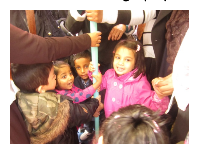
Look at us on the DLR!