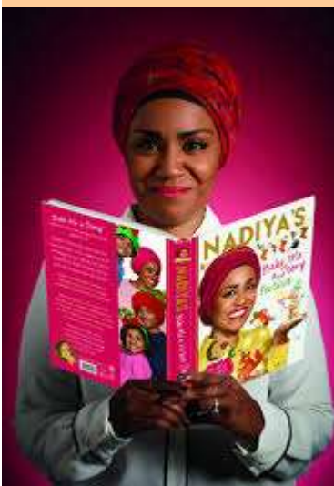
Nadiyah Hussain – recent winner of Bake Off!

Date: Friday 5 th October – let's have a Woolmore Bake Off!