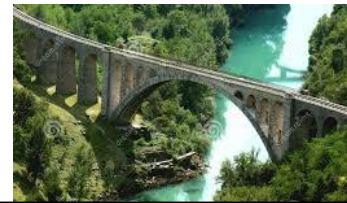
Stone railway bridge