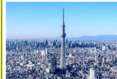
Tokyo Skytree – Tokyo, Japan