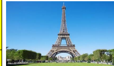
Eiffel Tower – Paris, France