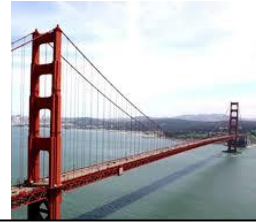
Metal suspension bridge

A bridge is a structure built over a road, river or railway that allows people or vehicles to cross from one side to the other. Bridges can be built from a range of materials.