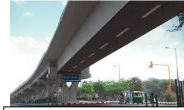
Concrete road bridge