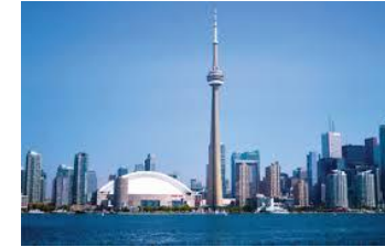
CN Tower – Toronto, Canada

A tower is a tall, narrow structure. Here are some famous towers from around the world.