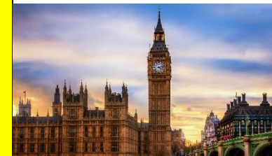
Big Ben – London, England