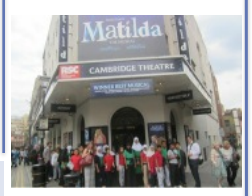
Y6 at the theatre to see Matilda, The Musical