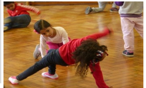
Reception children stretch out for the danceathon

Attendance at Woolmore continues to be AMAZING! Our class trophy winners always achieve 98/99/100%! This week we will be awarding special Easter prizes to all our 100% attenders this term. Well done to children and parents!