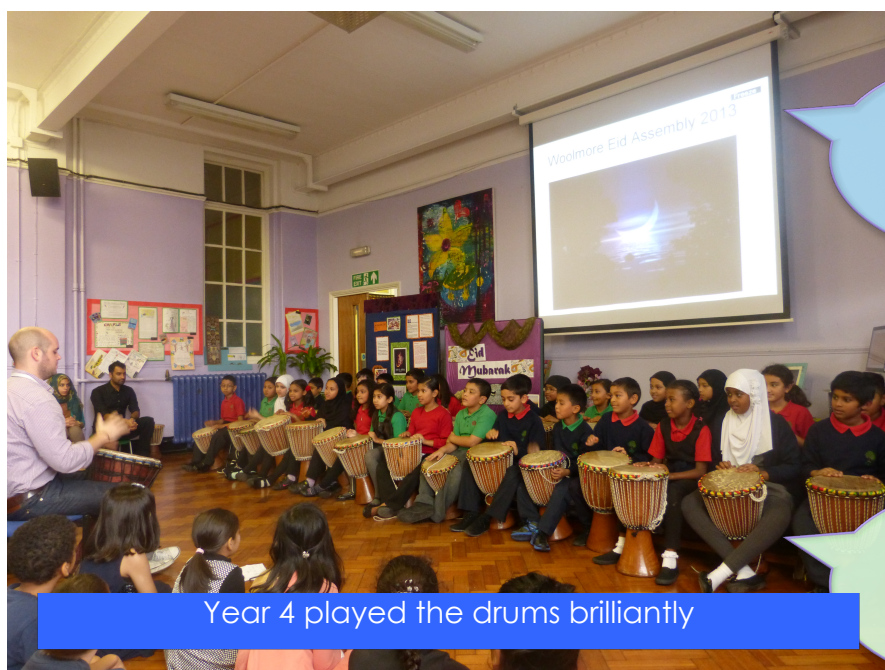
Year 4 played the drums brilliantly

'I was really moved by seeing all the children in assembly. Thank you.' Parent of Y5 pupil