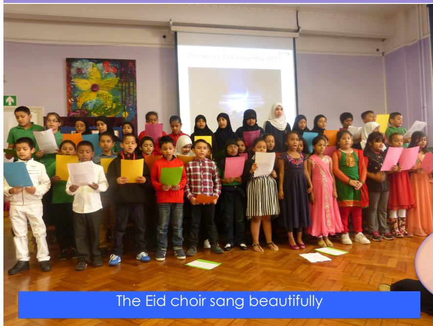
The Eid choir sang beautifully