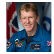
Tim Peake is the first British Astronaut to walk in space.