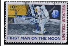
Stamp for Neil Armstrong