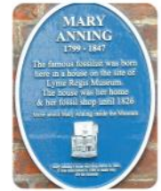
Plaque for Mary Anning