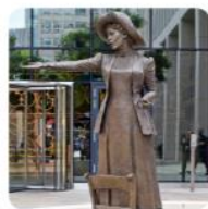
Statue of Emmeline Pankhurst

A memorial is made to remind people of a significant person or event. Memorials can include statues, monuments, plaques and stamps.