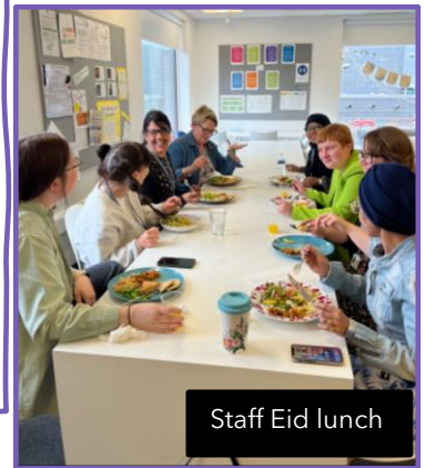
Staff Eid lunch