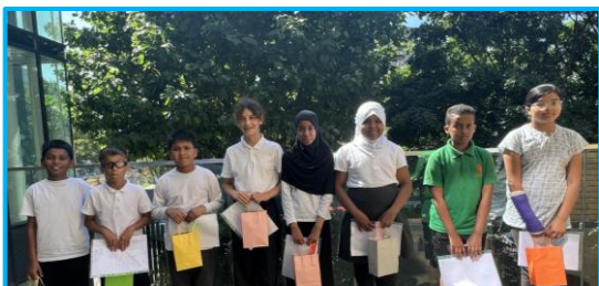
Belonging at Woolmore 'HTA-style'

At Woolmore, we know that good attendance and strong learning go hand in hand .