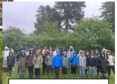
Our Year 5 classes have been visiting Gorsefield this week.

Although the weather has not always been on our side recently, our children haven't let that stop them enjoying the natural world in London and beyond! 🌞🌿